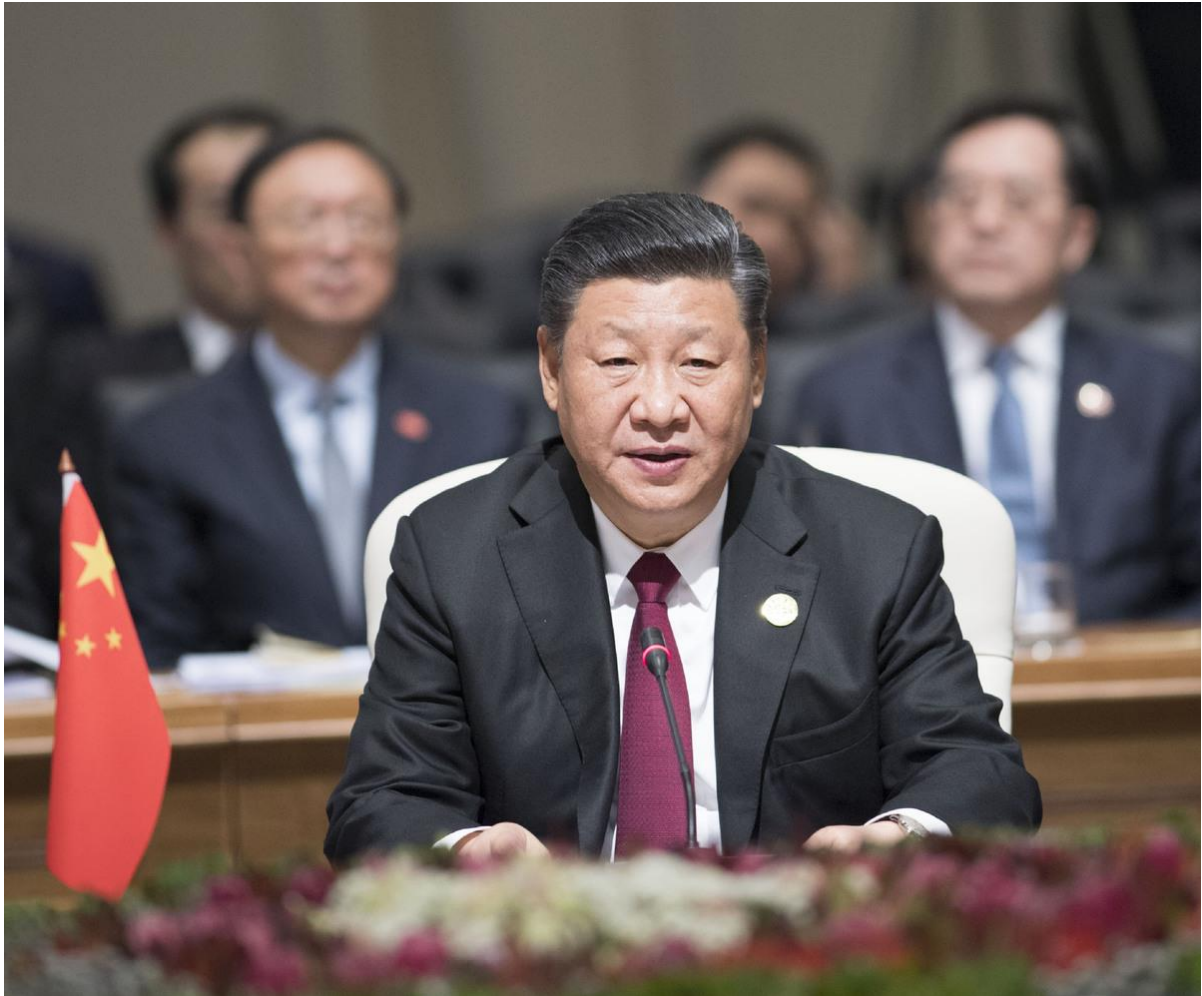
President Xi Jinping delivers a speech titled "Turn Our Vision into a Reality" at the Plenary Session of the 10th BRICS summit in Johannesburg, South Africa, July 26, 2018.

First, we must unlock the enormous potential of our economic cooperation. Closer economic cooperation for shared prosperity is the original purpose and priority of BRICS cooperation. It is also in the economic field that we enjoy the most promising, diverse and fruitful cooperation. We need to step up trade, investment, economic, financial, and connectivity cooperation to make this pie still bigger. At the same time, we must work together at the United Nations, the Group of 20, and the World Trade Organization to safeguard the rule-based multilateral trading regime, promote trade and investment liberalization and facilitation, and reject protectionism outright.